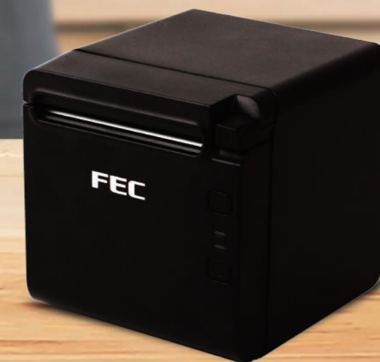
TP-100 XP-3685 with wallmount