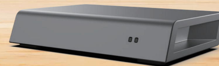
*XT-100 with basic I/O also provides USB DP wired connection