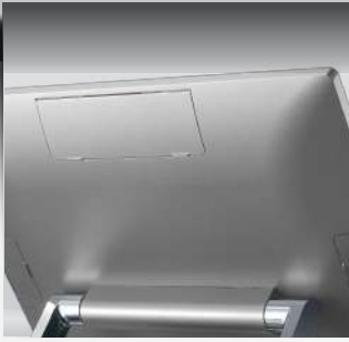
LCM/ 2nd Display

2nd Display Available in 8" and 10" can be extended as standalone, and 15" and 15.6 for docking only