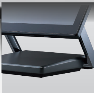
Xtation (I/O Box)