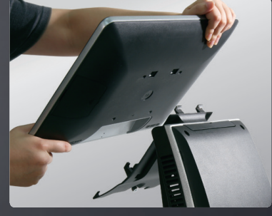
The display can be easily removed for easy maintenance