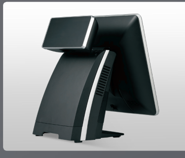
The integrated customer display can be turned and tilted for the best viewing angle.