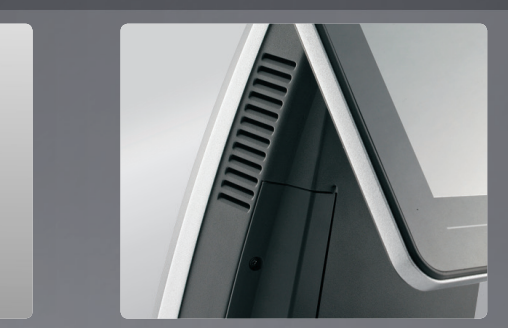
Smart Fan detects CPU temperature and adjusts fan speed automatically