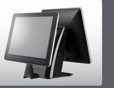
15inch second display (pole type)