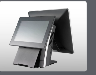
11.6inch second display with bracket