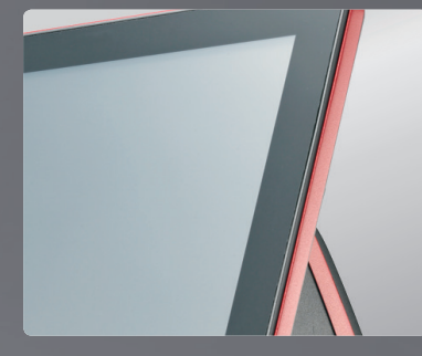
Standard Colors: Black + Silver; Black + Red; White + Silver