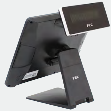
Intergrated Customer Display