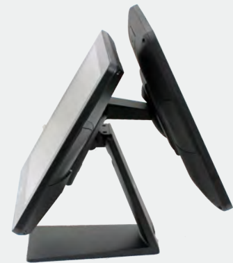
AerArm with 2nd Display