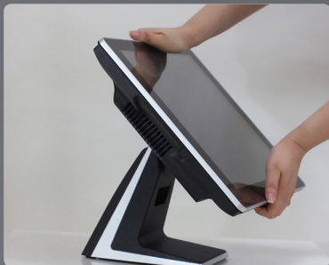
Display can be tilted various angles.