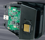
2in1 MSR + Fingerprint Reader