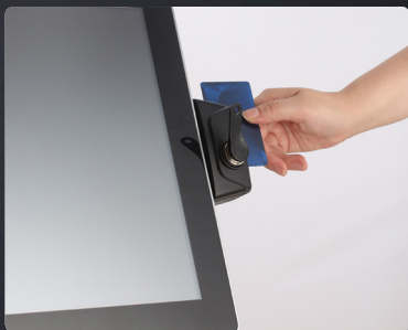
AerPPC is very versatile and offers many optional add-on devices