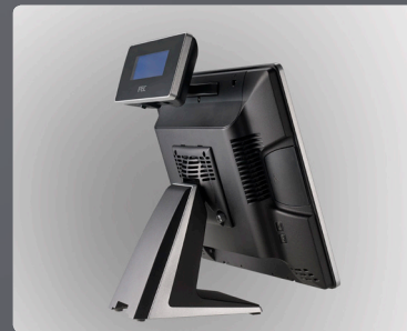
Integrated Customer Display