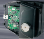
2in1 MSR + iButton