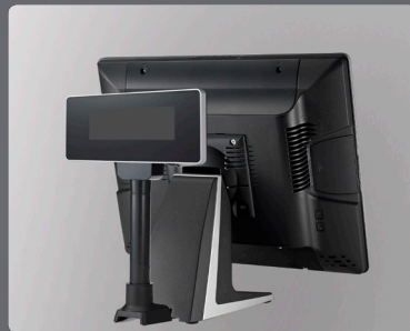
Integrated Pole Type Customer Display