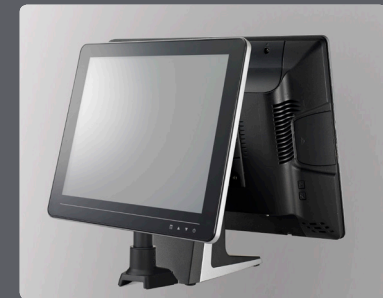
Integrated Pole Type 15inch Display