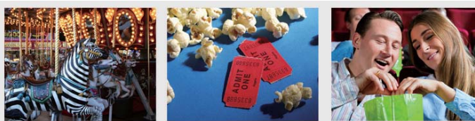
AMUSEMENT PARK TICKET